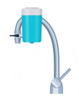
Faucet Attachment Filter

Examples of what different filter styles look like: