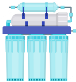
Under the Sink Filter